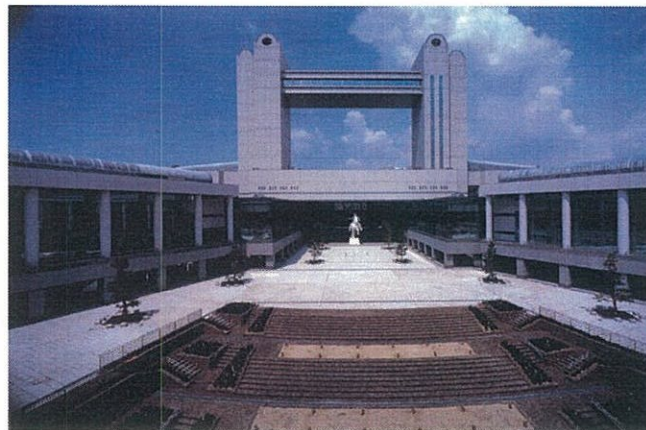
Nagoya Congress Center

There will be an exhibition by pharmaceutical machinery, excipient and allied companies to introduce new products and technologies to the participants. For those who are interested in reserving an exhibition booth, please contact the Organizing Secretariat for details.